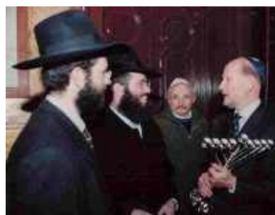
Bulgaria - Prime Minister Simeon II